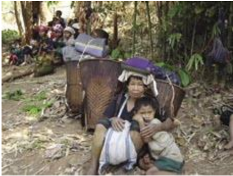
Internally displaced people running for their lives.

Many refugees from Sudan (normally from regions other than Darfur), Burma, and Tibet are living in the United States and other countries. Google the words “Sudanese refugees” along with the name of your town and see what comes up (and do the same with “Burmese refugees” and “Tibetan exiles” or “Tibetan refugees”...play with the words). You may find that there are refugees from Sudan living in your area – you may find that there are refugees from another country.