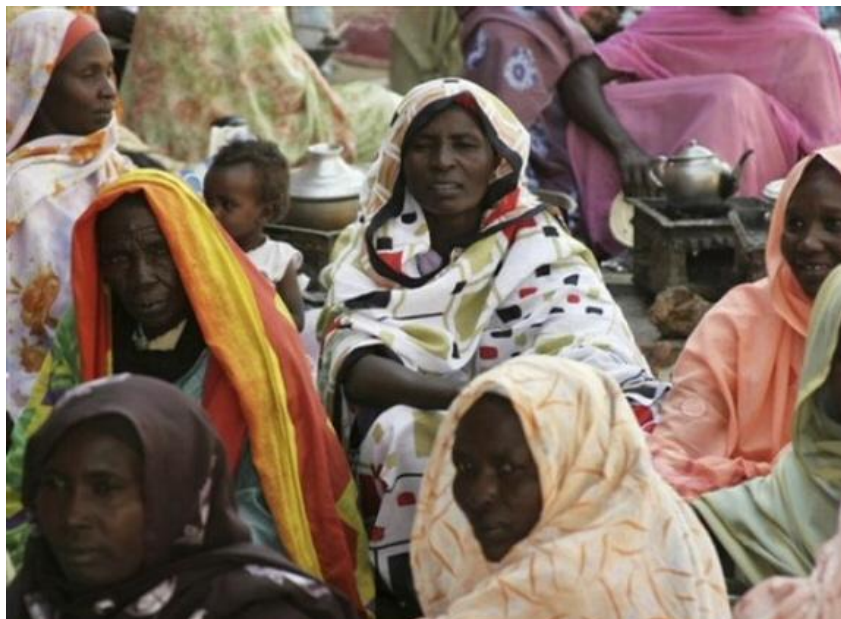
Darfuri Women