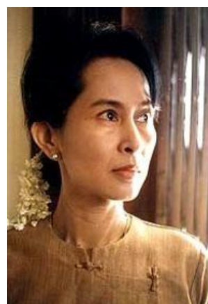
Aung San Suu Kyi, a Nobel Peace Prize Laureate, who has now spent more than 11 years under house arrest in Burma.